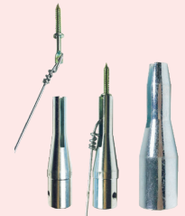
Pre tied head adapter